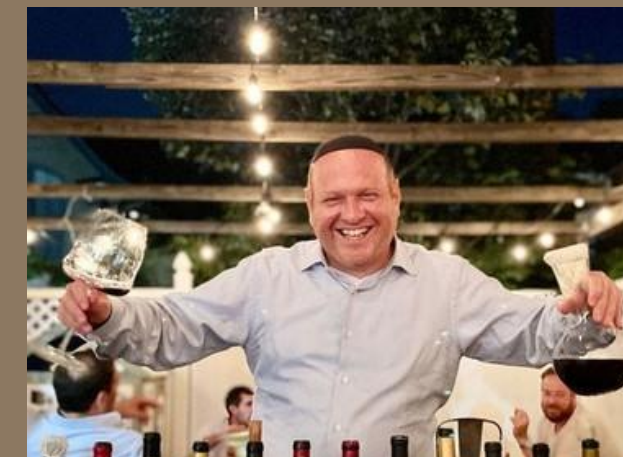
Ralph Madeb WINE SELECTIONS